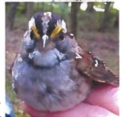
White Throated Sparrow