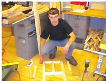
DC BOCES carpentry student working on Mill window.