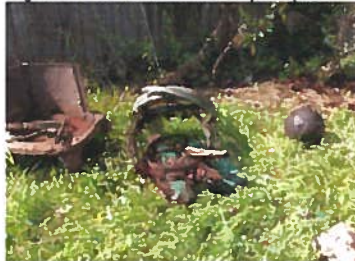
Artifacts retrieved during shed removal: cast iron wood burning stove; wooden barrel slats and metal rings; and bowling ball.